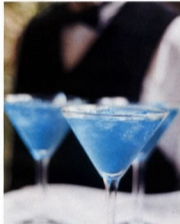
Have your caterer create a signature drink based on your wedding color scheme—a delicious detail that guests won't forget!

Creating a coordinated look for your wedding is easier than you think. Simply pick a color or let your surroundings guide you, and extraordinary details can take shape. Here, creative tips that will help you build an incredible event of your own.