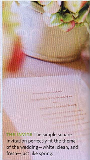
THE INVITE The simple square invitation perfectly fit the theme of the wedding—white, clean, and fresh—just like spring.